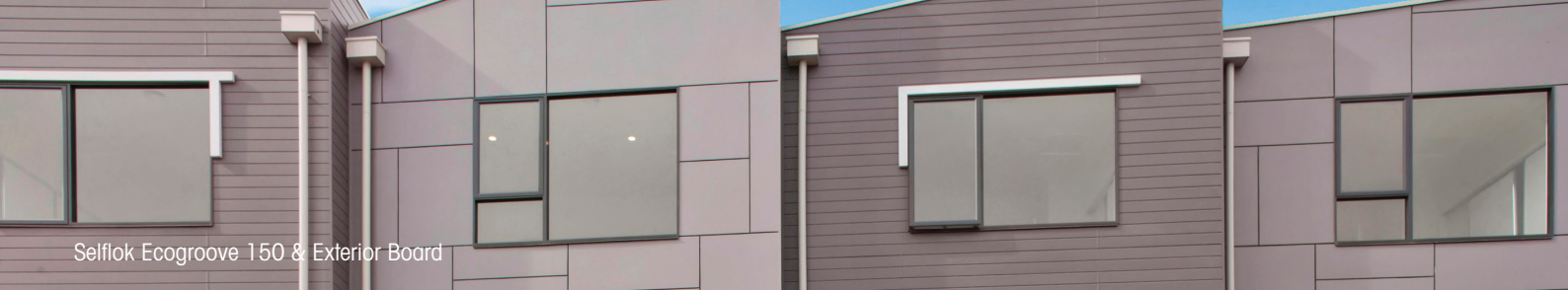
Selflok Ecogroove 150 & Exterior Board