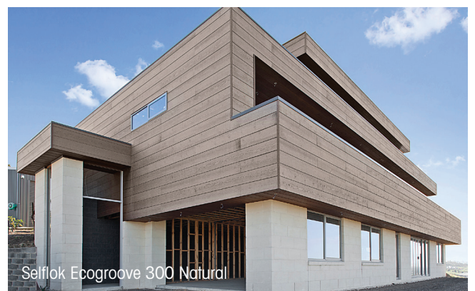
Selflok Ecogroove 300 Natural