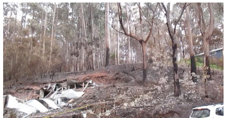
Bottom Right: Rubble is all that is left of a neighbours house, seen on the left of the image. Damo's house can be seen still standing off to the right edge of the photo.