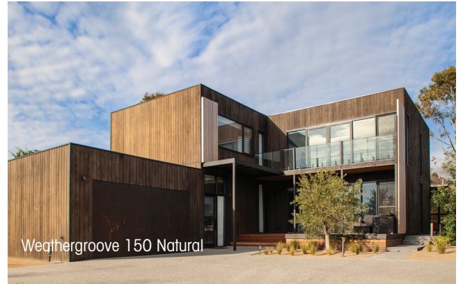
Weathergroove 150 Natural

Weathertex has similar properties to most fire resistant timber species; our products have been assessed by a third party for verification to the bushfire standard. The Australian Standard AS3959: Construction of Buildings in Bush fire Prone Areas provides the framework for what is now acceptable in building throughout most of Australia. Weathertex is suitable for use in BAL-LOW, BAL-12.5 and BAL-19 construction levels. The BAL rating determines the product's resistance to the direct radiant heat in the event of a bushfire. Check with your local authorities to establish what is acceptable in your location.