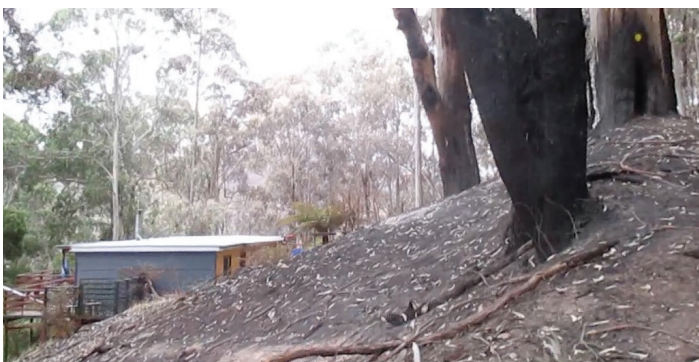
Main and bottom left image: The house is still standing even when all the surroundings were engulfed in a bushfire that destroyed other houses in the same area.